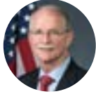
Hon. John Rutherford 5th District, FL