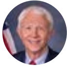
Hon. Jack Bergman 1st District, MI